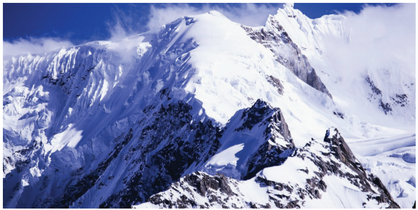
The Midui Glacier in Tibet.