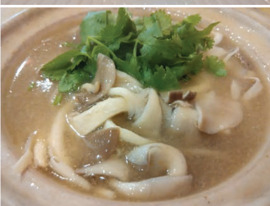
Can you just imagine how healthy you would be if you ate meals like these? And how happy the animals of the world would be? And the forests and the whole planet???