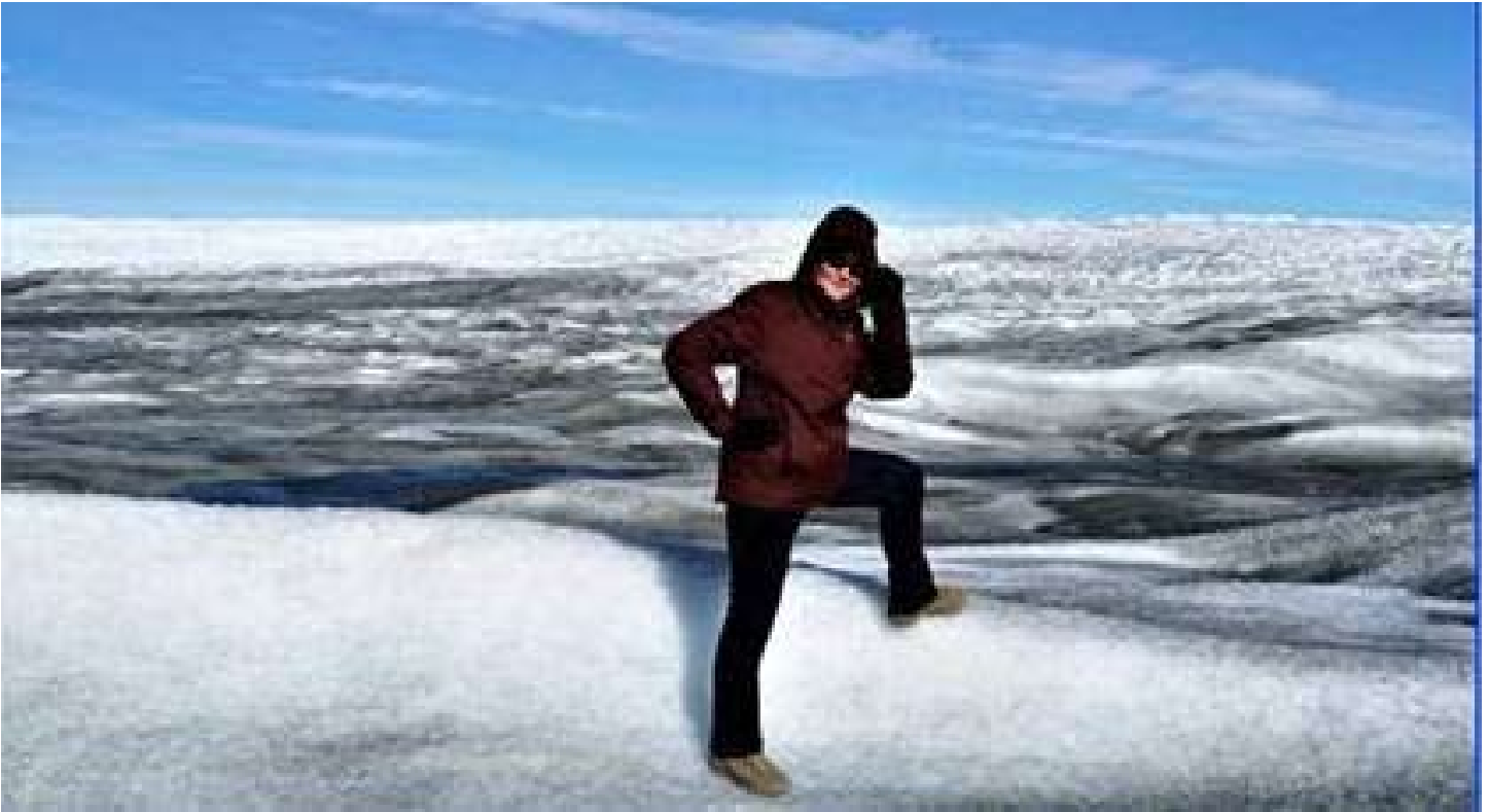
Photo attributed to the rapidly vanishing Greenland Ice Sheet