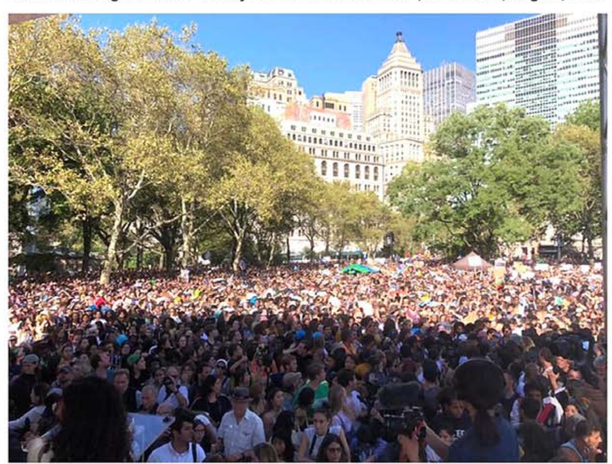
Thirteen months later, it is a worldwide movement, involving hundreds of thousands Has there ever before been a political movement that has taken off so quickly? (Started by a fifteen-year-old school girl?)