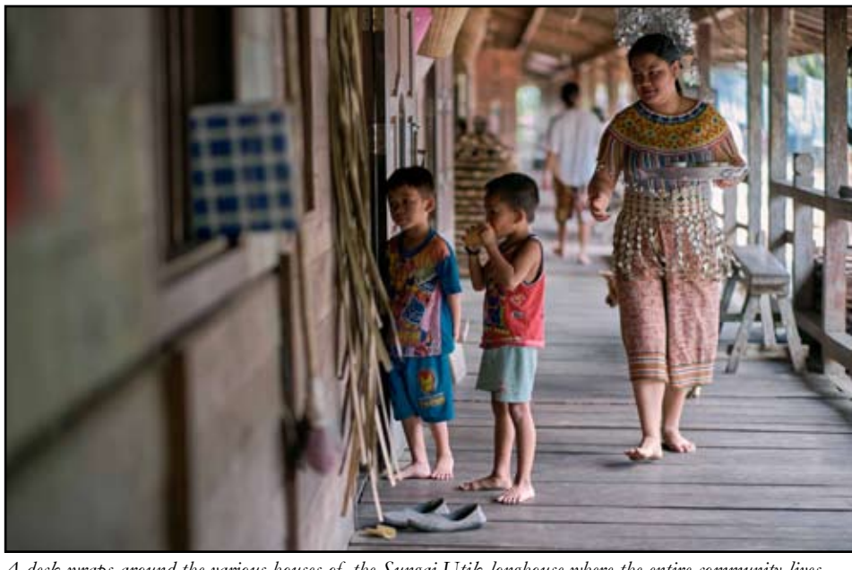
A deck wraps around the various houses of the Sungai Utik longhouse where the entire community lives.