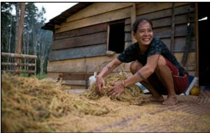
Sungai Utik's victory covers 9,480 hectares (23,426 acres) of the community's forestland and another 607 hectares (1,500 acres) of croplands. It's the largest activists have been parcel of land ever granted to an indigenous community in Indonesia.

The alliance is building the connective tissue between, and power among, major grassroots forest guardians, including AMAN, the Mesoamerican Alliance of Peoples and Forests, Articulation of Indigenous Peoples of Brazil, and Coordinator of Indigenous Organizations of the Amazon Basin. The alliance has helped these organizations link their causes to larger social movements and generate pressure for change with international bodies such as the UN and World Bank.